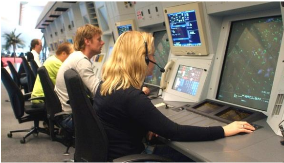
LVNL, the Netherlands Air Navigation Service Provider operates the Area Control Centre at Schiphol.

As part of the on-going investment at Schiphol ATC Centre, LVNL, the Netherlands Air Traffic Service provider have selected the Thruput multipurpose switch solution to enable seamless operation between their existing Main and new Backup ATC systems.