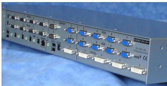
Front view of the GF 1030 SW multipurpose switch.